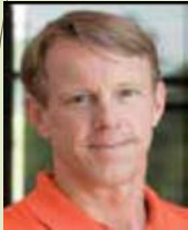
LAIN MARS Automotive Manufacturing Clemson